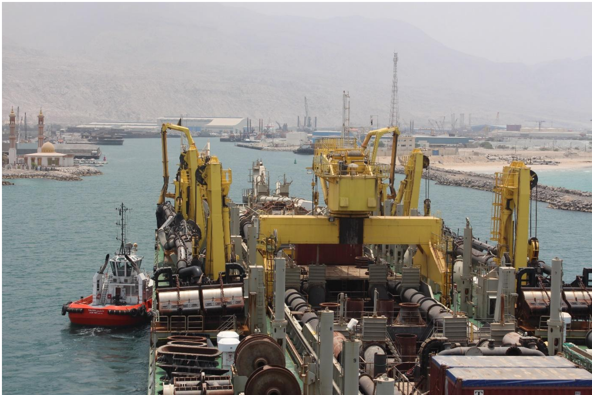
RAK Maritime City Harbour Channel