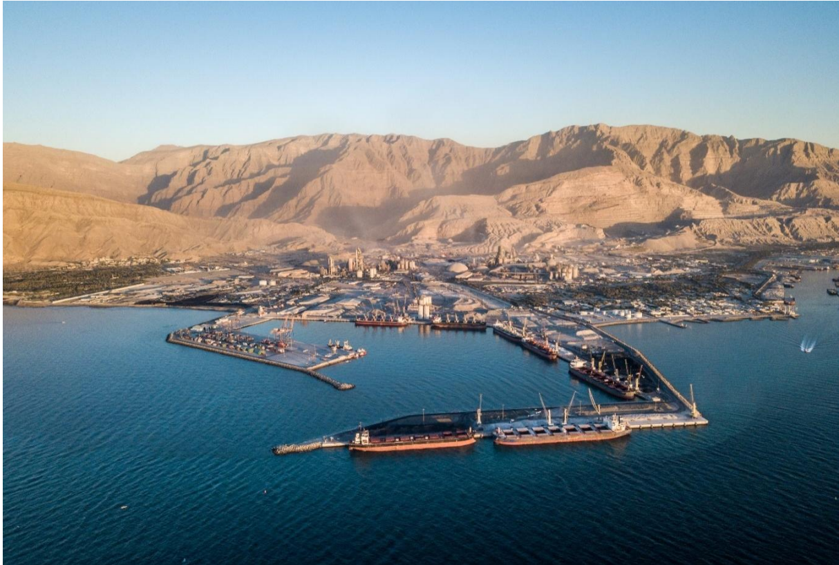
Saqr Port (Inner Harbour and Deep-Water Bulk Terminal)