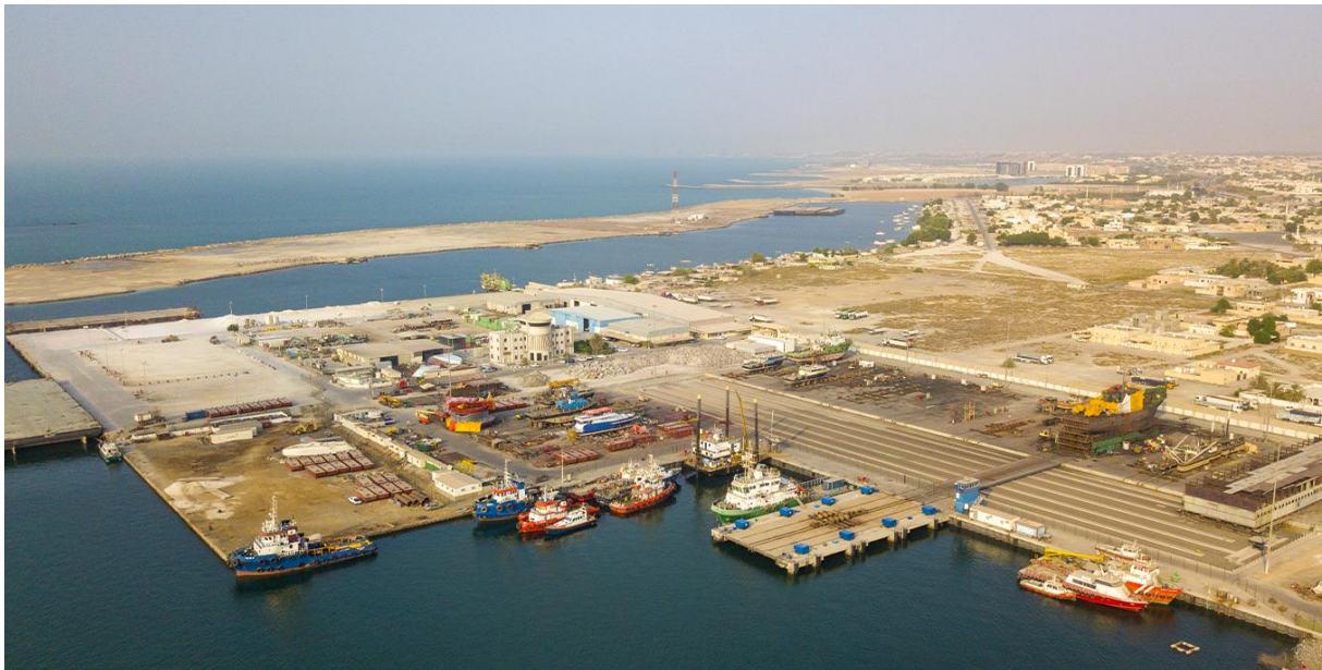
Al Jazeera Port & Drydock