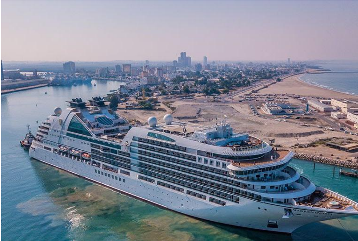
Ras Al Khaimah Port