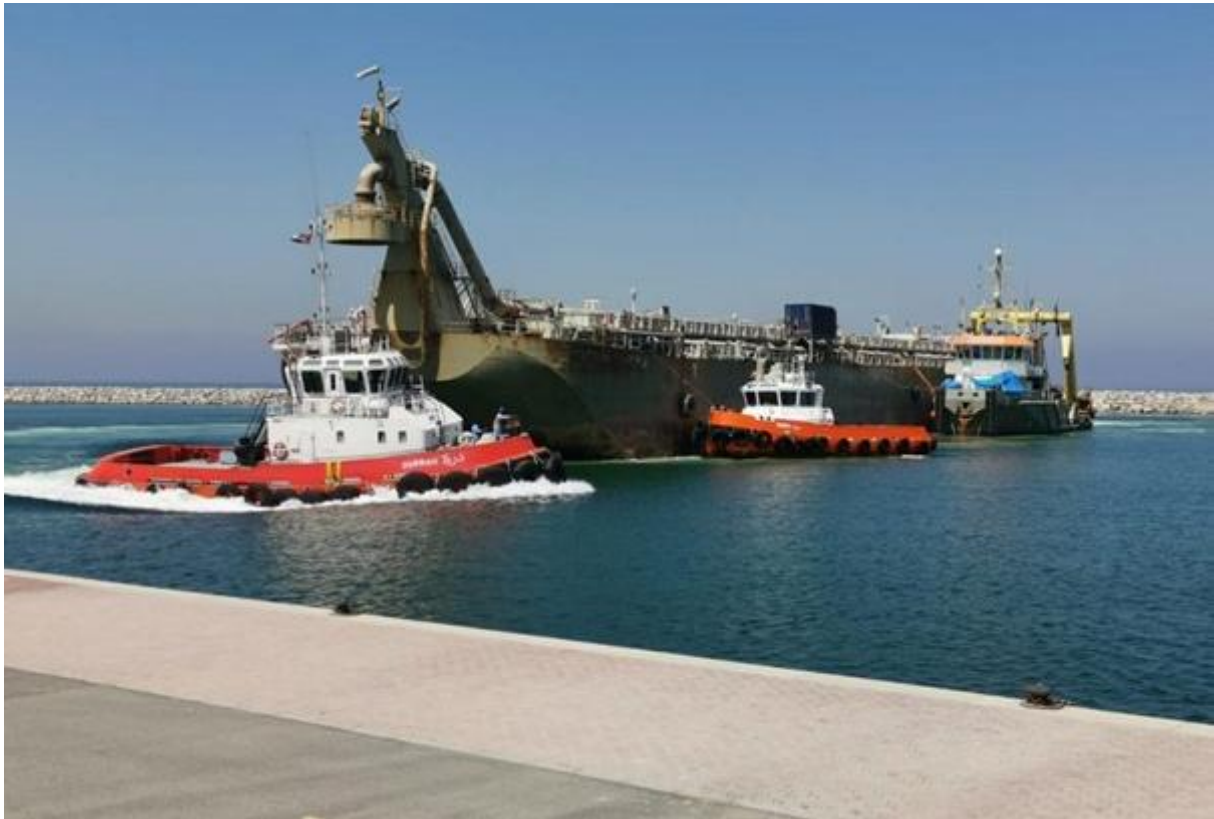
Al Jeer Port